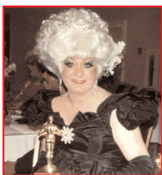
Liz Taylor, 1985

Today drag performance in the city centers on club shows and the Washington Academy, gay Washington’s first (1961) social and support organization.