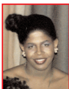
Sparkle, 1975

⇒ 1. 1919 Connecticut Ave NW - WASHINGTON HILTON - In February 1968, Black Pearl's International Awards show was the drag event of the year and broke the main hotels' ban on drag events.